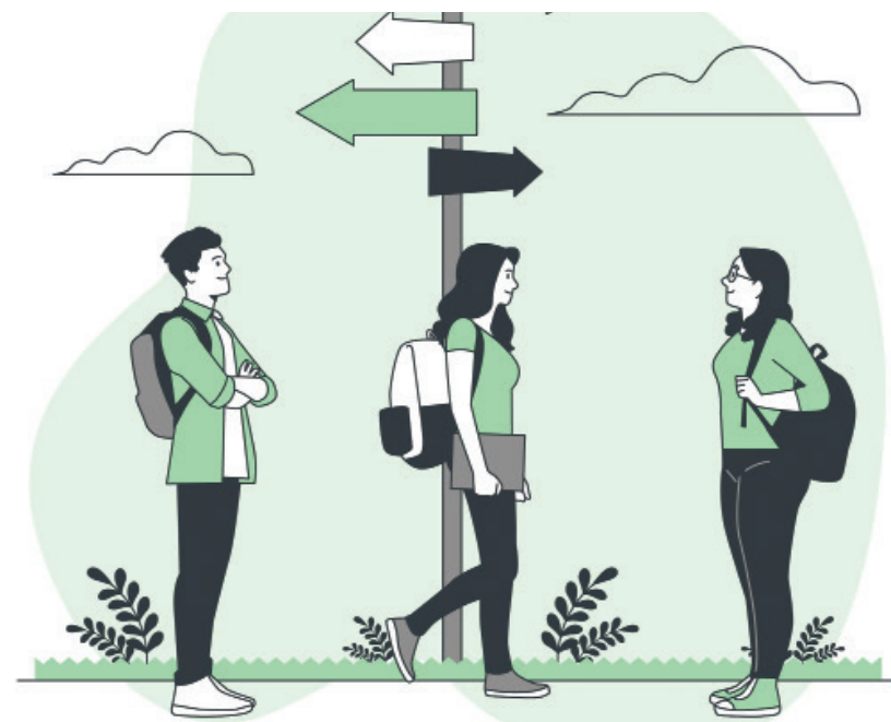
Sometimes, going outside the box can lead to even more opportunities. Taking an elective is a risk for some, but can also be surprisingly helpful in many ways.

Another case for students with certain interests is that a student-