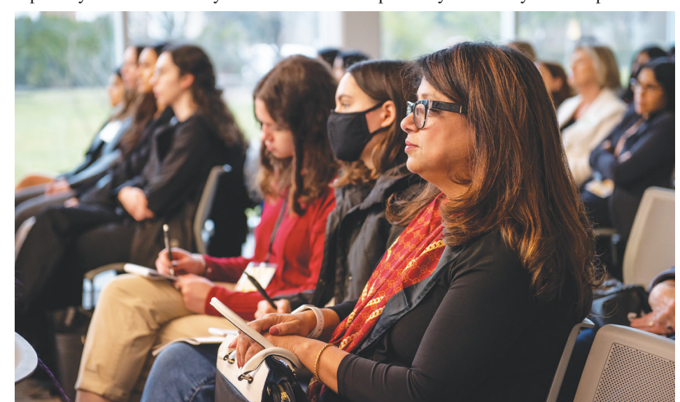
Adelphi students were among the audience attending the "Finding Your Leadership Style" afternoon hybrid breakout session.

West advised the audience to "share all parts of yourself in your workplace. Be