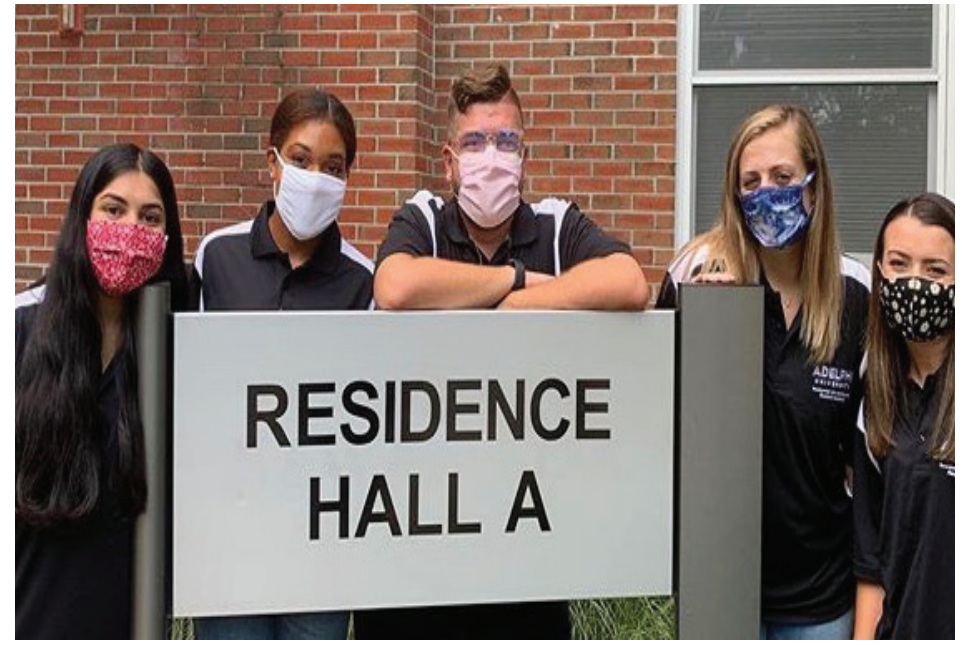
The new RA staff of Resident Hall A get set to welcome back their residents for a new fall semester.

Throughout the semester Adelphi will also be holding many online events that can help you sharpen your skills. The main website will be filled with events