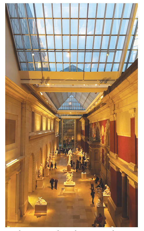
In day or night, the Met's beauty shines.

may think that the Met is not worth their time but this is where they're mistaken. Here are five reasons why you should add this historic site to your must-see list.