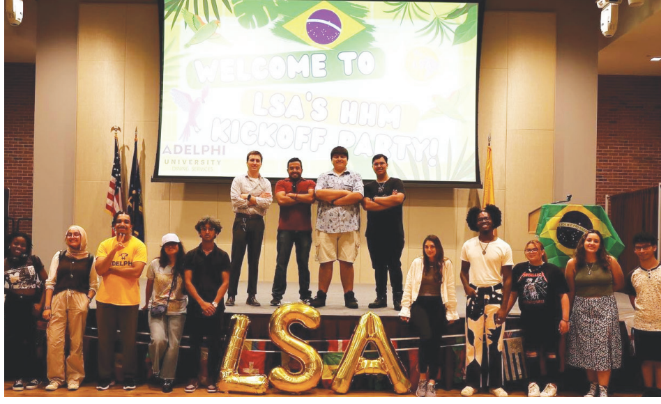
The Latino Student Association celebrates Hispanic Heritage Month by throwing a kickoff party. Every year they hold a theme. This year's theme was Brazil.