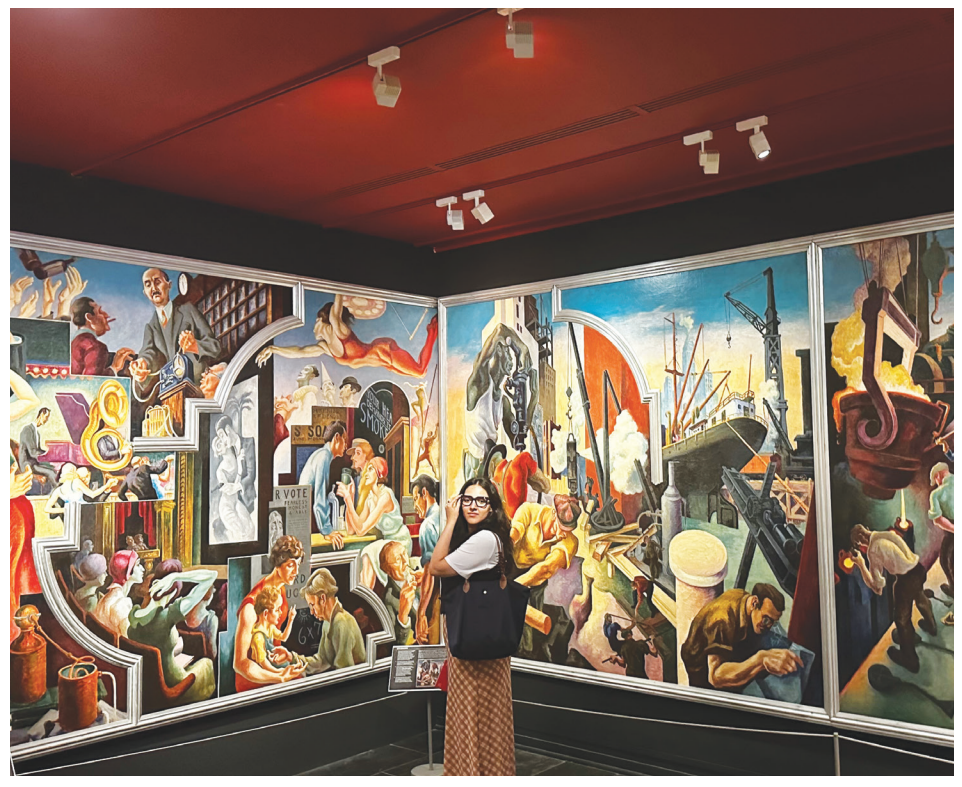
A continuous painting by Thomas Hart Benton fills up a huge room in the Met.

2. Museum collections cover many art fields and eras. Although the collections in the museum often change and one story is replaced by another on the wall, it is always possible to see the most legendary paintings among them. The museum's 19 departments house the works of artists who made world art history such as Pablo Picasso, Vincent van Gogh, Claude Monet, Gustav Klimt, Paul Gauguin, Caravaggio, Johannes Vermeer and many others. In the museum, you will find works for people interested in all eras, be it the Bronze Age, Renaissance, Baroque or Modern art. There are also exhibitions for those interested