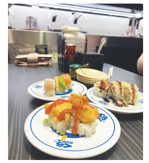
Kura serves up innovative service.

Additionally, each table has a tablet which allows for personal delivery of any menu item directly to the table. The food comes out on a separate conveyor belt and stops right at your table. The tablet announces its anticipated arrival with a bell tone and a written announcement of what food is on its