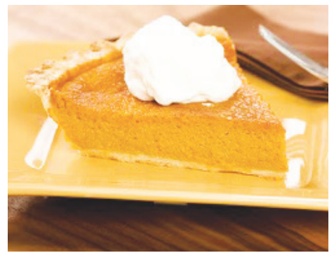
Classic but elevated, the addition of caramel sauce to your sweet potato pie filling can enhance its sweetness.

Life is always sweet with a classic, timeless dessert. This month make your Thanksgiving spread even sweeter with a sweet potato pie with a caramel twist. As someone who's made this dish