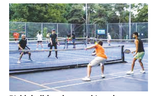
Pickleball has been taking the sports world by storm and will soon be found all over our Garden City Campus.

tions major, expressed her excitement when she first heard the announcement. "If Adelphi announced a pickleball team with open tryouts I would certainly be the first person to try