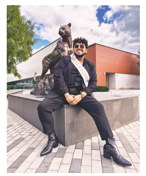
The statue of Kennie will be built over this summer so that incoming students of the 2024-'25 school year are able to admire it in full.

phi students haven't seen the rooftop on the Nexus Building. You get a view of the Flagpole Lawn and South Avenue adorning a beautiful azure sky. Although the area is small, it's the perfect place for a rooftop party.