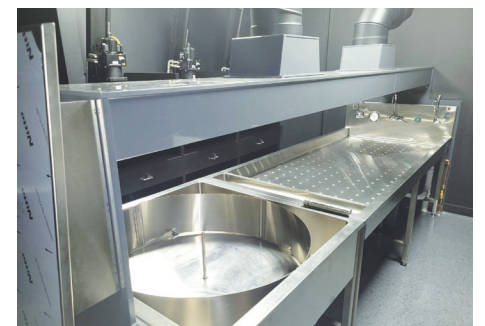
Blodgett Hall room 310 photography dark room sinks

"When I was an Adelphi student, I only had the opportunity to take two courses in Blodgett Hall, one of which was in Room 109, a now impressive lecture hall. I'm happy to say that Room 109's redesign is one of my most satisfying projects because the room is so much more inviting, bright and conducive to learning—now more people can experience this terrific new space and more programs, and faculty can request to use it," he said. 🍀