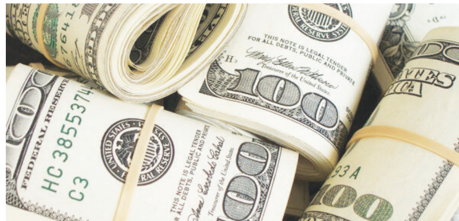
Adelphi's tuition has increased by $3,360 since the 2022-'23 school year.

"Beginning with the entering class for fall 2023, we now award scholarships