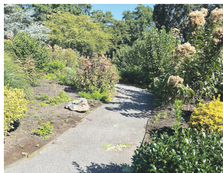
Pathway through the native garden near Alumnae Hall, where new plants will grow.

phi campus, does not use any pesticides which makes it a safe home for insects. It is in direct sunlight as well, which is