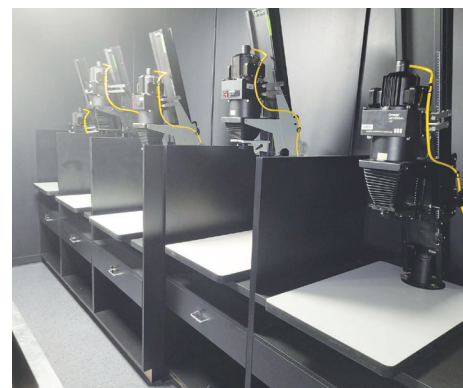
Blodgett Hall room 310 photography dark room enlargers

In the third floor, Room 310 was modernized into a professional photography lab, and its air conditioning and