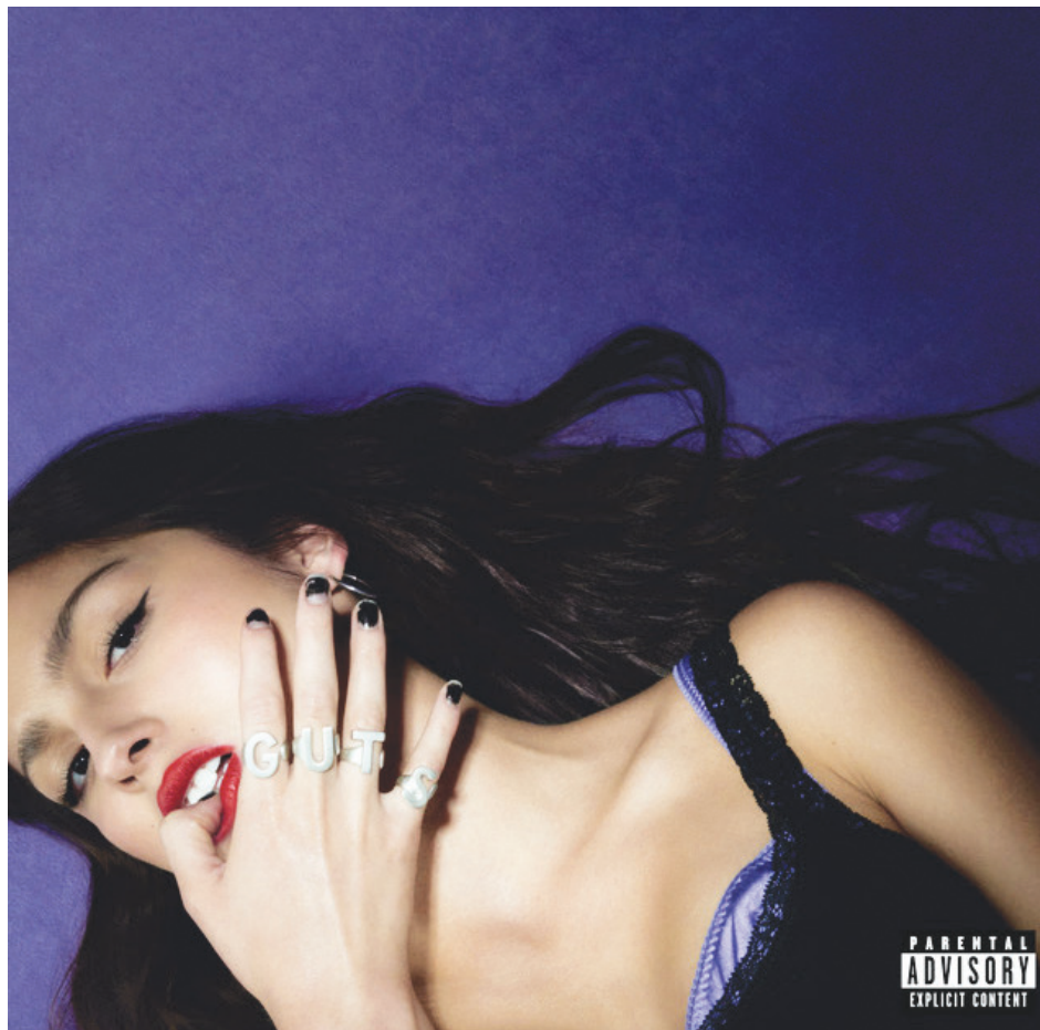
"Guts" album cover (from Spotify)

One thing Rodrigo did incredibly was the intros. "grudge" has one of my favorite intros. It starts out as a soft piano, playing one key at a time, and you can almost hear the pur-