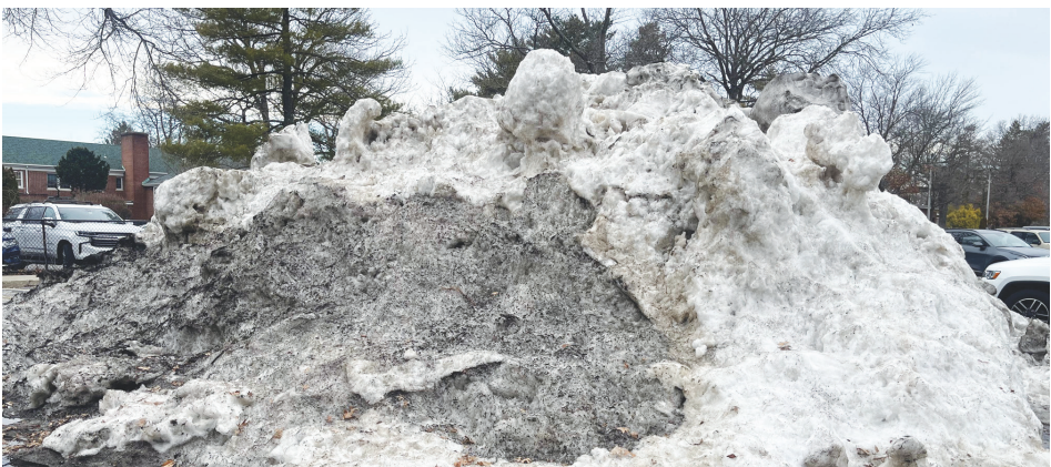
Until recently, these piles of snow in the parking lot on the side of Cambridge Avenue mysteriously continued to grow, taking up numerous parking spots. Security cameras captured the 12-foot piles expanding overnight and Public Safety even reported that they had pulses. Eventually Facilities was able to successfully load them onto pickup trucks and they were taken away from campus so that spring could officially arrive.

“As if I couldn’t have any more questions: Is it really necessary to have a helicopter pad on campus?” said one student who asked to be anonymous. The administration has declined to comment. 🐾