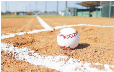
Juan Soto’s contract may be good news for Mets fans, but for students, their pockets are feeling lighter after Adelphi’s sketchy connection to the team’s acquisition.

Helping win the American League pennant with the New York Yankees in 2024, Soto was criticized by Yanks fans for choosing the Mets’ turf in Queens instead of the Yankees’ 16-year, $760 million offer. To this, Soto said the decision in part came because the fewer miles between the Mets’ Citi Field and Adelphi would make it easier for him to be driven to campus after games for his contract-binding appearances at the university’s donor events.