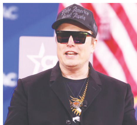
Elon Musk is slated to land at Adelphi University's 2025 Commencement — literally.

Because Elon Musk's 2025 mission seems to be to have his hand in every aspect of American society, he recently announced he's coming to Adelphi to speak at the 2025 commencement ceremony. Musk is one of the most famous people in the world — and the richest — so having him speak at Adelphi's commencement in May could be a once in a lifetime experience for the Panther community.