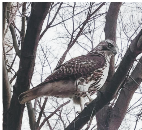
Adelphi's resident hawk proves that sometimes sitting still is the ultimate power move.

ever asked me how I felt about it. Have you seen the world lately? Hawks don't get health insurance. Out there, it's nothing but high winds, bad weather and pigeons with no sense of personal space. Here, I had people taking care of me, a prime campus location, and what I can only assume is a growing fan base. Why would I rush to leave?