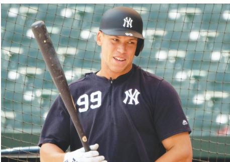
Yankees captain Aaron Judge on William J. Bonomo Memorial Field.

When asked about his decision, Judge reportedly said, “I’ve conquered Yankee Stadium. Now it’s time for a new challenge: college baseball.” He added, “I want to help