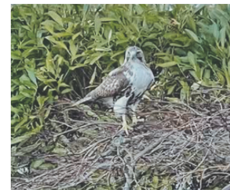
Another view of the Panther hawk.

For now, the hawk remains perched, quietly judging students who are probably running late for class while trying to juggle a coffee and their life choices. His stillness is a reminder that sometimes, you don't need to fly to be important — sometimes,