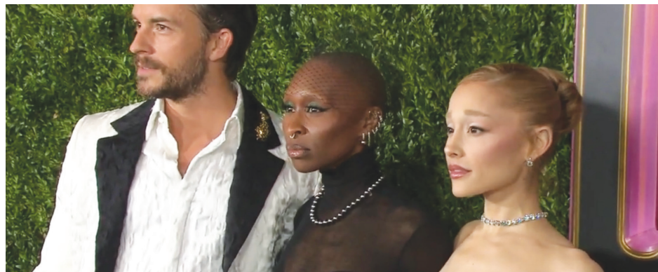
Students are excited to attend this year's spring concert featuring Ariana Grande and Cynthia Erivo (without Fiyero).

Costume Design and Best Achievement in Production Design. Because of the success of the film, both Grande and Erivo have agreed