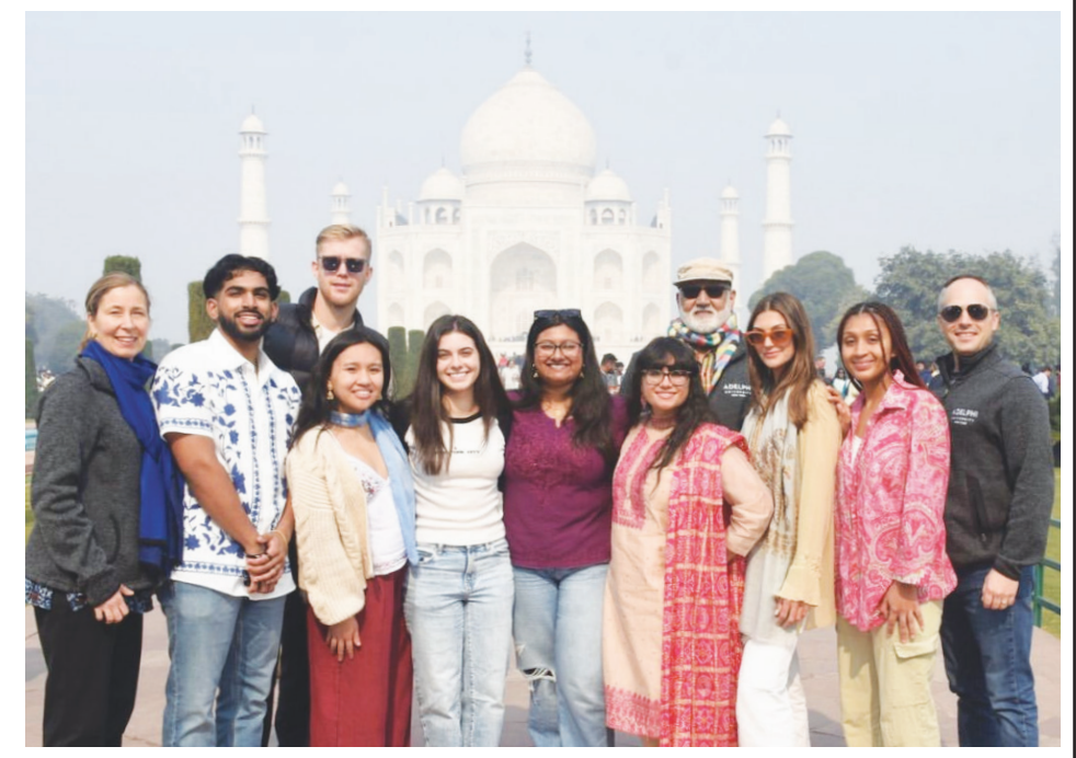
Adelphi students and faculty gain new experiences on the 2024 Bhisé Global Learning Experience to India.

global issues such as climate change, Continued on page 6