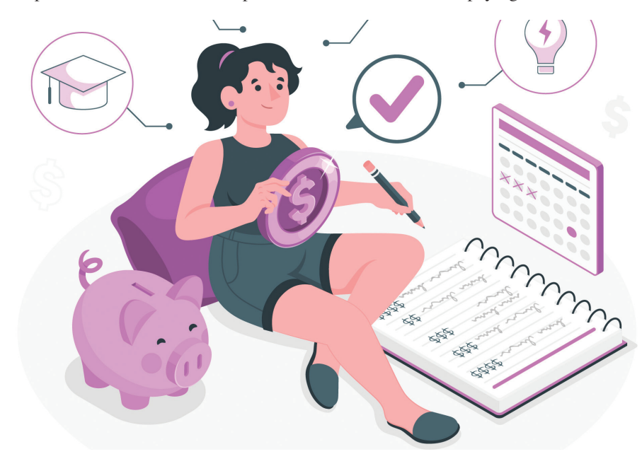
Managing student loan debt is a challenge, but there are resources available to help people minimize their debts.

cost increase has occurred at a much faster rate than inflation, which means that students are paying more for their