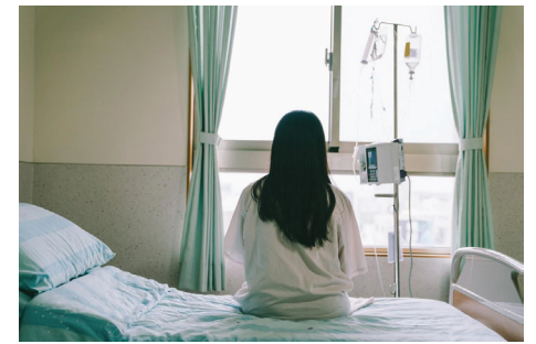
Socially distanced doesn't mean safe. More people struggle with mental illness during the Covid pandemic.

Especially now, when anxiety is not so easily combated, and its presence can inflict serious damage, I find it helpful to reach out to people. Letting someone know you're there if they want to or need