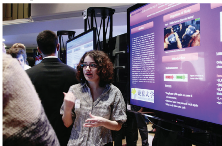
A previous presentation at the Adelphi Scholarship and Creative Work Conference.

This year the event will take place virtually on Tuesday, April 27 from 9:30 am to 3:30 pm. All of the traditional formats (e.g., talks, posters, creative exhibitions, etc.) will