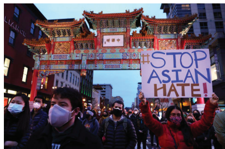
Asian-Americans have faced a surge in hate crimes during the coronavirus pandemic.

This rise of the negative association with the Asian-American community and their "responsibility" for spreading the virus, has led a lot of people, particularly journalists and activists, to attribute the primary catalyst of this spike to former President Trump's rhetoric on referring to Covid-19 as the "Chinese virus." These are bold claims, but these assumptions are not surprising as President Trump and his supporters have long been associated in the media for emboldening white supremacy and racism all over the country for the past five years.