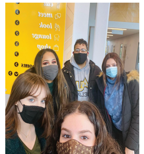
Students on campus exploring the newly renovated University Center.

While some policies can be more strictly enforced, other policies