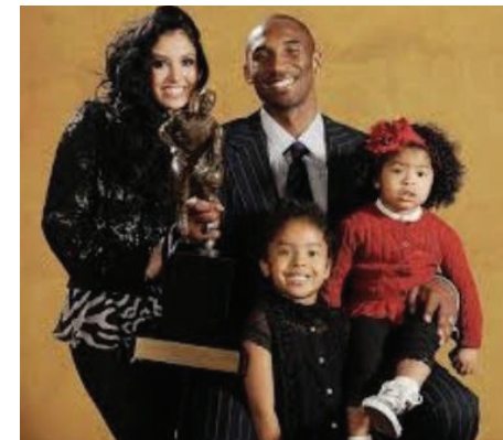
Kobe Bryant was not only a terrific athlete, but also a loving husband and father to his kids. (above)