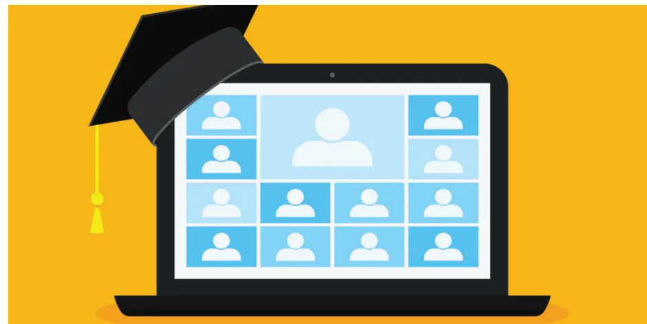
Zoom has had a drastic effect on our education and is changing the future for higher education. Distance learning via Zoom is here to stay.

Zoom will most likely not be going away any time soon. The vaccine, however, does offer hope in possibly seeing a full reopening of campus in the fall semester. The more we continue to practice social distancing and other safety guidelines, the quicker we can hopefully kiss Zoom goodbye.