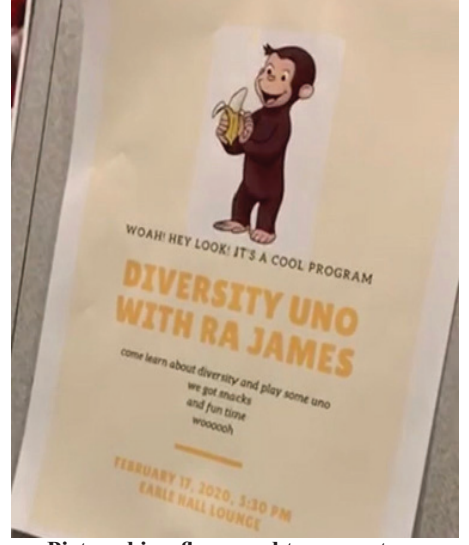
Pictured is a flyer used to promote a Residence Hall program about diversity and inclusion earlier this year. Students say the use of Curious George is an example of institutionalized racism.

feel the university does enough to support social movements. "They send out campuswide emails explaining that they support them... but that's it. What good does just an email do?" he said.