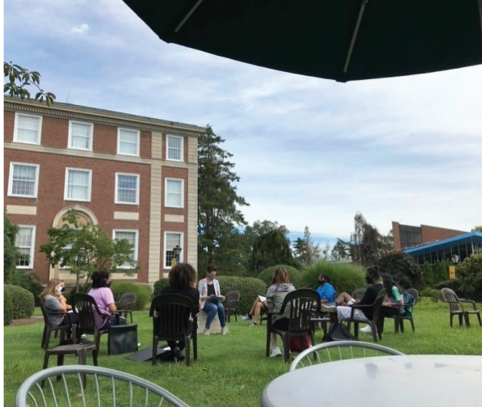
A new reality on campus: classes taking place outdoors as a means to further enforce social distancing and remain safe.

"I've learned to manage wearing a mask in the classroom," she said. "Now, I wonder how long it'll be before I am able to recognize expressions of learning (or what professors call that Aha! moment) behind a mask. In a few weeks, I will likely identify a new challenge. My point here is that it takes time and effort to manage a new teaching environment and we're all in a learning phase."